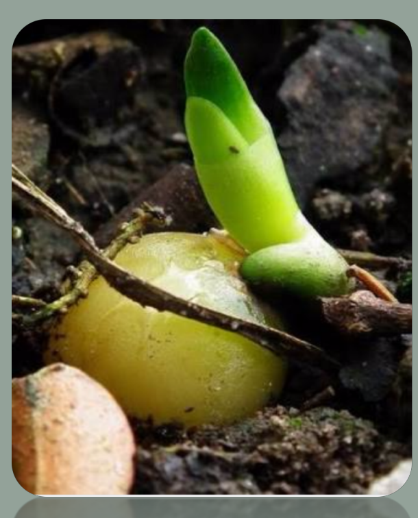
Clivia miniata seedling