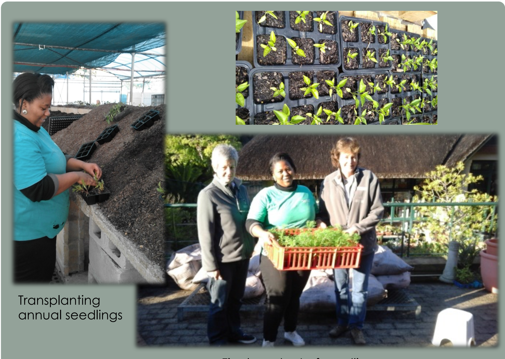
Final product of seedlings