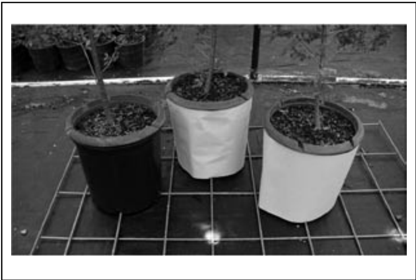
Figure 4. One option for positioning support pots with locations of next containers to be added marked with white paint. Unprotected support pot (left) and with RootSkirts® (right).