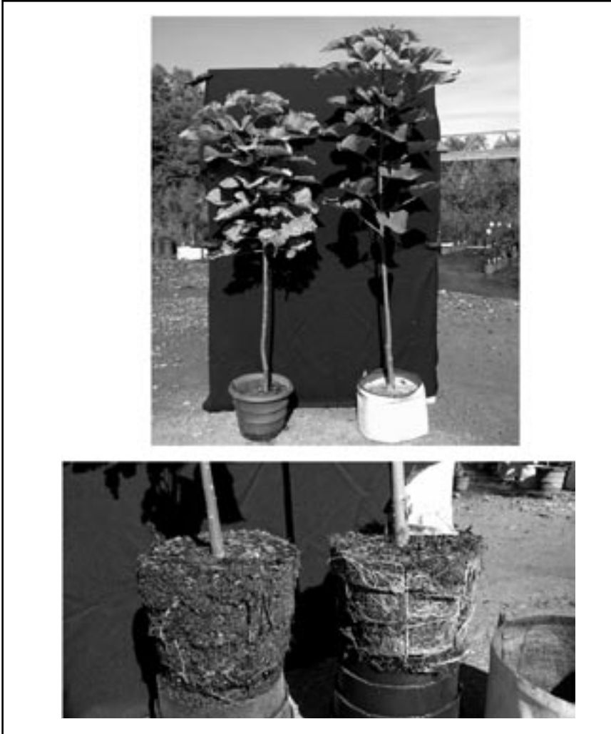
Figure 6. On 7 Oct. catalpa trees were evaluated for height and stem diameter. Trees grown in a support pot with protection of RootSkirt® and RootCap® averaged 0.4 m (16 inches) greater height and 0.6 cm ( \frac{1}{4} inch) greater stem diameter compared to RootMaker® 3-gal container not protected [above, the background was 1.8 m (6 ft) tall]. In addition, there were few roots on the side of the black container exposed to the sun (left) whereas roots were plentiful on the sunny side with the RootSkirt® (right).