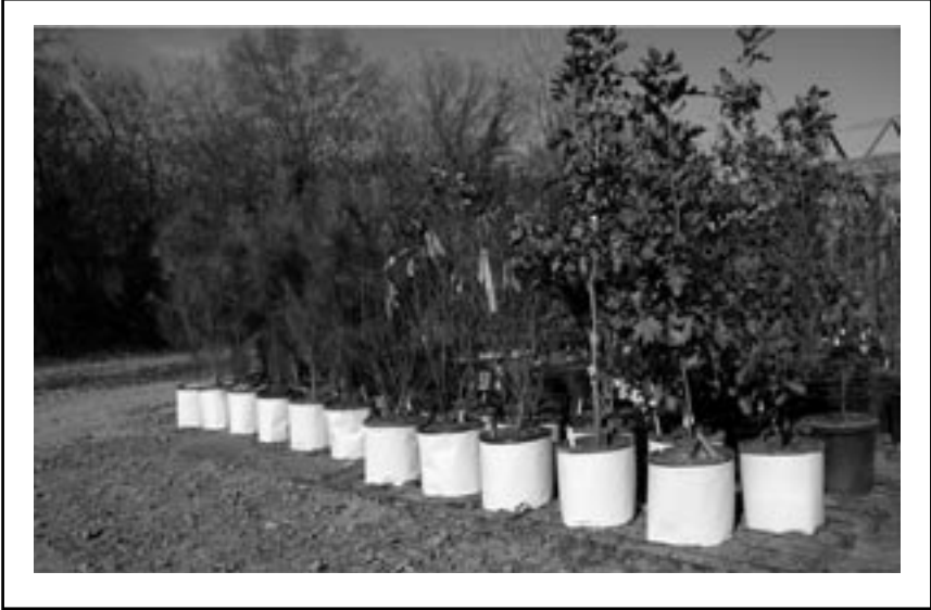
Figure 7. A portion of the overwinter study using RootSkirts® on injection-molded support pots secured to stock panels. Many of the shumard oak, catalpa, crapemyrtle, and pine trees had grown 5 to 6 ft tall in one growing season. Watering at intervals during the winter was necessary as a result of evaporation from the growth medium. Trees with RootCaps required less watering.