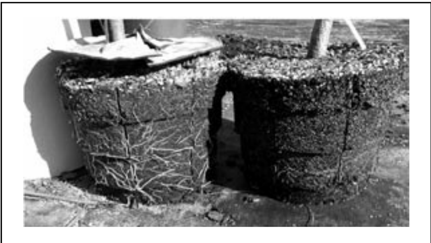
Figure 8. Shumard oak roots protected by RootSkirts® had many white roots (left) whereas with protection of only the support pots, white roots were few and near the bottom (right)