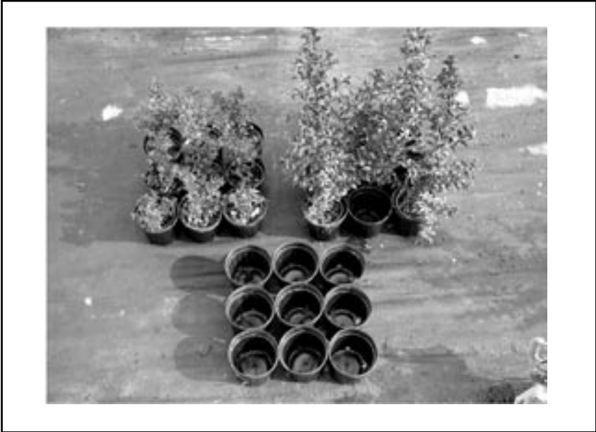
Figure 1. Nine support 1-gal pots (front), with production containers in each cavity (upper left) and with tall plants that need more room in five of nine cavities (upper right).