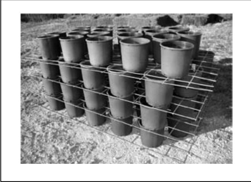
Figure 5. This stack of 2.4 m (8 ft) long units was moved to the side of a production bed to allow regrading and drainage improvements.

poly and wind and then early spring new growth and aphids and mites, and on and on, just seemed too good to be true. Anyone that has experienced the poly house overwinter dilemma is looking for a way out (Gouin, 1973, 1974, 1976; Whitcomb 1980, 1983, 2003; Williams and Whitcomb, 1985).