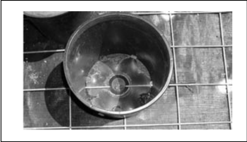
Figure 3. Proper positioning of the base pot is important.