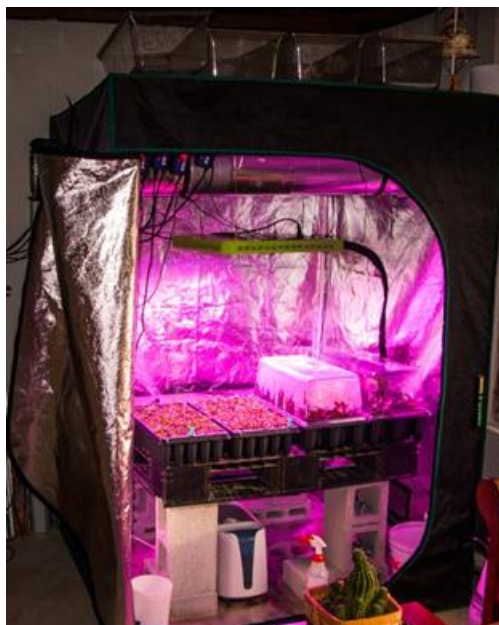
Figure 2. Propagation tent setup.

Tissue culture shoots are succulent and have limited carbohydrate reserves from which to draw for rooting. For me, that meant they need to root quickly under conditions with little stress. Therefore, I had the need to develop a propagation system that was highly controlled (Figure 2).