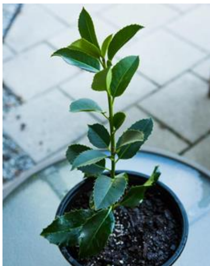
Figure 5. Ilex sp.