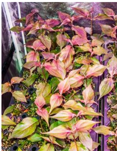
Figure 3. Cornus kousa 'Rutpink', Scarlet Fire® kousa dogwood at 60 days.