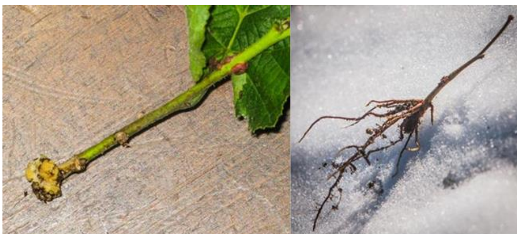
Figure 4. Excess callus on Corylus (left) and callus on Corylus and the rooted cutting (right).