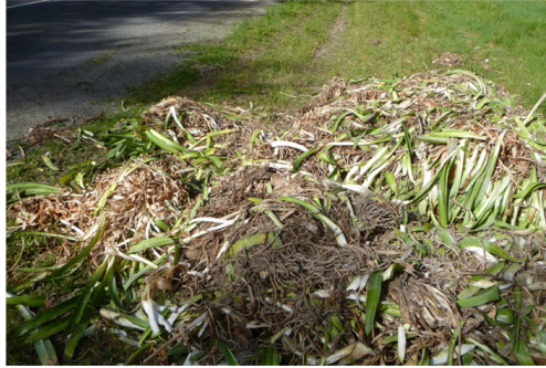
Figure 6. Roadside dumping of Agapanthus praecox subsp. orientalis .

Agapanthus typically produces abundant seed (Figure 7) that germinates readily. This seed can spread by wind and water—particularly along drains and waterways (Figure 8). Deadheading (removing seed heads before the capsules split open) to reduce seed dispersal is timing dependent, and for large areas tedious and impractical.