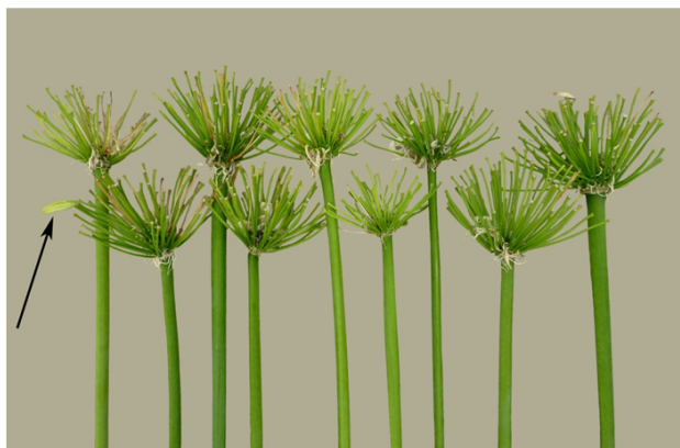
Figure 21. Rare capsule formation on Agapanthus ‘Finn’ PVR, a confirmed low fertility cultivar.