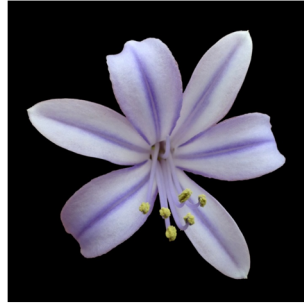
Figure 13. Agapanthus 'Glen Avon', showing a flower with six tepals and six anthers.