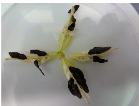
Figure 19. Dissected four-locular capsule of Agapanthus praecox subsp. orientalis providing a comparison of the dark, broad, presumed viable seed with light colored, smaller, inviable seed.

The tall-growing “wild-type” ( A. praecox subsp. orientalis ) typically has a three-locular seed capsule (and occasionally four-locular; Figure 19). Each typical locule has the capacity to physically house up to eight seeds: 8 \times 3 = up to 24 seeds per capsule.