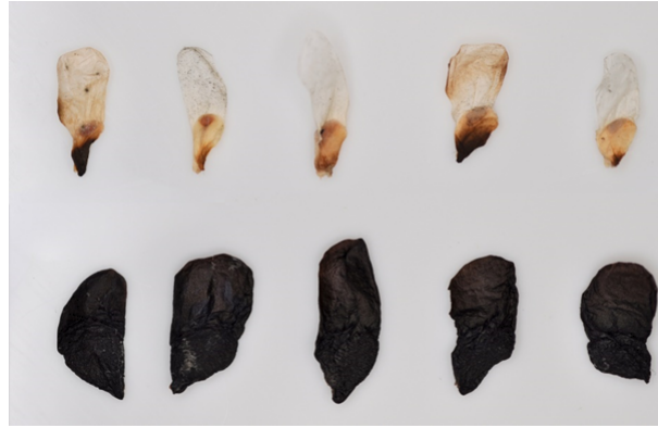
Figure 12. Undeveloped seed in Agapanthus is easy to recognize: upon maturity of the fruit capsule, inviable seed is lighter colored, smaller, and flattened (top row). In contrast, filled, “viable” seed is black / dark brown and broader (bottom row).

Adoption of “ Ecopanthus TM ” for certified low fertility agapanthus cultivars would rely on agreement within the nursery industry and availability of the NZPPI trademarked name to all growers. There would also need to be agreed exemptions for certified low fertility agapanthus from regulatory authorities (such as exemptions within regional councils’ RPMP’s and potentially in the New Zealand Ministry of Primary Industries NPPA listings) that may ban propagation, sale, and distribution of the fertile counterparts.