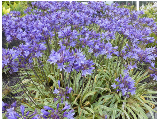
Figure 3. Agapanthus 'Goldstrike', a variegated green- and white-leaved cultivar.

Their strap-like leaves are usually green or with a blue-green waxy (glaucous) surface and leaves of some selections have purple bases. Several cultivars have green leaves that are variegated with white and/or yellow bands (Figures 3 and 4).