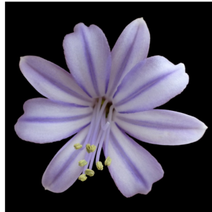
Figure 14. Agapanthus 'Glen Avon', showing a flower with eight tepals and eight anthers.