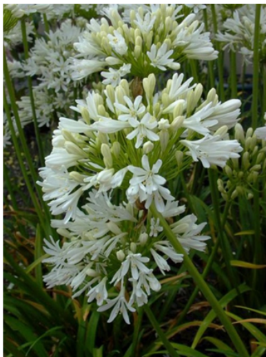
Figure 9. Agapanthus 'Finn' PVR , a low fertility cultivar with white flowers.

Consequently, Auckland Council funded Manaaki Whenua Landcare Research to independently study and quantify fertility of agapanthus. Sterility and low fertility claims made of two dwarf cultivars, A. 'Finn' PVR (Figure 9) and A. 'Sarah' PVR (Figure 10), were used as exemplars and studied in detail. They were compared against tall-growing A. praecox subsp. orientalis and the fertile dwarf cultivar A. 'Streamline' . A wide range of techniques were used, to determine the levels of both male and female fertility, including pollen staining, pollen-tube germination, artificial crossing experiments (self, sib and outcrosses), seed counts and germination rates.