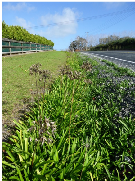
Figure 8. Agapanthus spreading along a drainage ditch, outside of a lifestyle block, north of Auckland city.