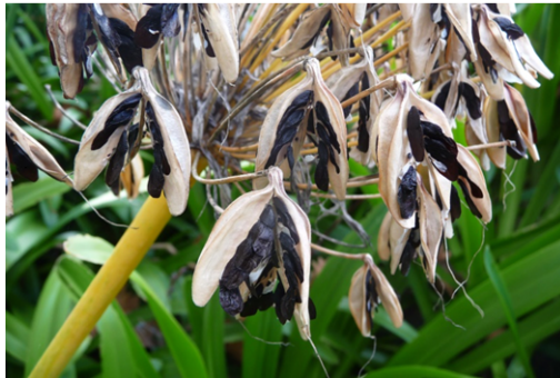
Figure 7. Mature head of a typical high seed set, tall-growing Agapanthus praecox subsp. orientalis . Photo: Murray Dawson.

Agapanthus typically produces abundant seed (Figure 7) that germinates readily. This seed can spread by wind and water—particularly along drains and waterways (Figure 8). Deadheading (removing seed heads before the capsules split open) to reduce seed dispersal is timing dependent, and for large areas tedious and impractical.