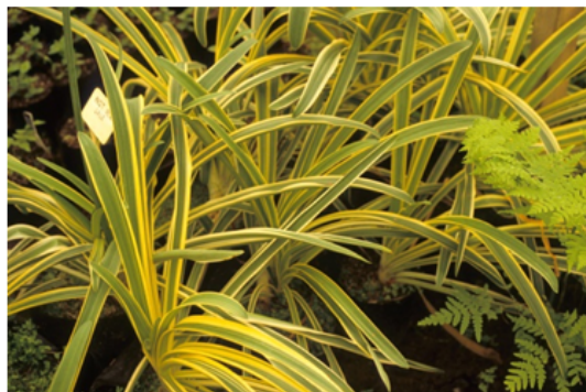
Figure 4. Agapanthus 'Tigerleaf', a variegated green- and yellow-leaved cultivar.