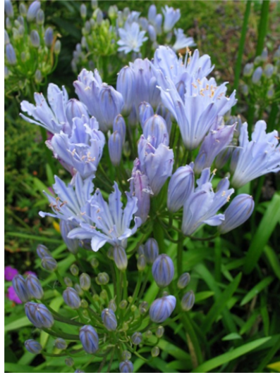
Figure 10. Agapanthus 'Sarah' PVR, a low fertility cultivar with soft blue flowers.

These techniques quantified male (pollen) and female fertility (seed set and germination), and confirmed low seed set in A. 'Finn' PVR and A. Sarah' PVR. However, as both were found capable of producing germinable seed neither could be described as sterile or seedless. The results of this work were presented as a technical report (Ford and Dawson, 2010) and popular articles (e.g., Dawson and Ford, 2012), and pointed the way to future research and fertility assessments.