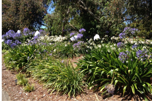
Figure 11. Agapanthus cultivar trials at Auckland Botanic Gardens, January 2017.

Open-pollinated seed set observations from the ABG trials were complemented by Murray Dawson who made separate observations for an agapanthus collection grown in glasshouses and shade-houses at Manaaki Whenua Landcare Research, Lincoln, Canterbury. Observations from both locations (Auckland and Canterbury) were made each fruiting season from 2012 until the present time (2017).