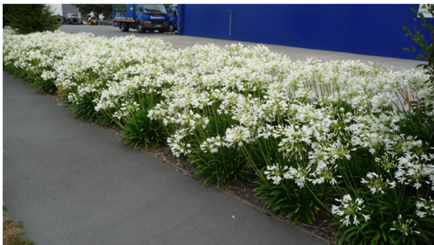
Figure 1. Mass planting of a medium height white-flowered agapanthus cultivar to enhance an industrial street front.

They are useful garden, container and amenity plants used for mass plantings in herbaceous borders, along driveways and roadside banks, and on traffic islands (Figures 1 and 2).