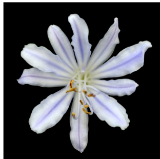
Figure 16. Agapanthus 'Sarah' PVR, a low fertility cultivar showing a flower with ten tepals.