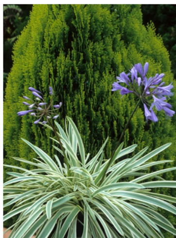
Figure 18. Agapanthus 'Tinkerbelle', a cultivar with variegated leaves.

The variegated cultivar, A. 'Tinkerbelle' (Figure 18), presents an interesting case in assessing fertility. Like some of the other variegated cultivars, it is an intermittent shy flowerer, and sets little seed per plant on an average season. However, seed set of A. 'Tinkerbelle' is moderate per flower head when it does flower.