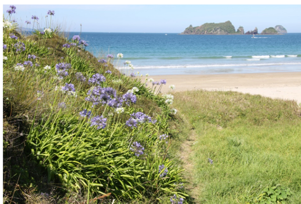
Figure 5. Blue- and white-flowered Agapanthus praecox subsp. orientalis naturalized at Opito Bay on the Coromandel Peninsula.

Wild populations of agapanthus can threaten remnant indigenous ecosystems, and flourish in coastal, frost-free (or lightly frosted) warm temperate climates. Agapanthus is tolerant of a wide range of soil types and growing conditions—from dry exposed environments to damp, lightly-shaded sites. Among other habitats, it has naturalized in coastal areas (Figure 5), along roadsides, and in wasteland. There is no biocontrol available, and (as previously mentioned) it is relatively resistant to herbicides.