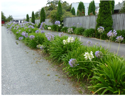
Figure 2. Tall-growing white- and blue-flowered Agapanthus praecox subsp. orientalis planted between driveways.

Agapanthus has resistance to glyphosate (e.g., Roundup®) so amenity plantings can easily be kept clean of emerging weeds by spraying the ground around them—agapanthus are not bothered by minor overspray.