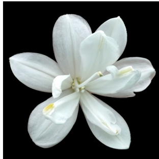
Figure 15. Agapanthus 'Snowdrops', a low fertility cultivar showing pataloid conversion of anthers creating an inner whorl of additional floral parts.