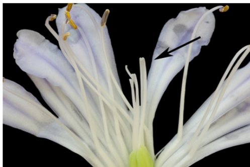
Figure 17. Split styles (arrowed) and deformed stigmas, aberrations typical in the flowers of the low fertility cultivar Agapanthus 'Sarah' PVR.

Table 1 shows that sterility/very low seed set among the 10 cultivars listed is closely associated with dwarf selections, variegated foliage, and/or abnormal flower parts including multi-tepals (low fertility can occur in plant groups where anthers and other floral parts are converted into additional petal-like structures, disrupting normal functioning) (Figures 15-16) and aberrant stigma/styles (Figure 17).