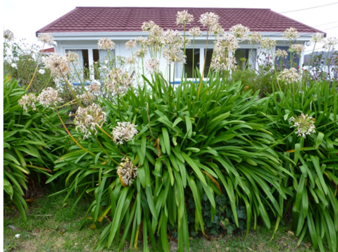
Figure 20. Large plant in seed of Agapanthus praecox subsp. orientalis , from Diamond Harbour, Canterbury, June 2016.

A more rigorous survey of tall-growing agapanthus was undertaken in Auckland, where 100 open-pollinated seed heads were collected from plants growing around the city, and an average of 10 fully formed (dark colored) seeds in each capsule was obtained. This equates to an average of 41.7% seed set per (24-place) capsule (the range was 33-96%).