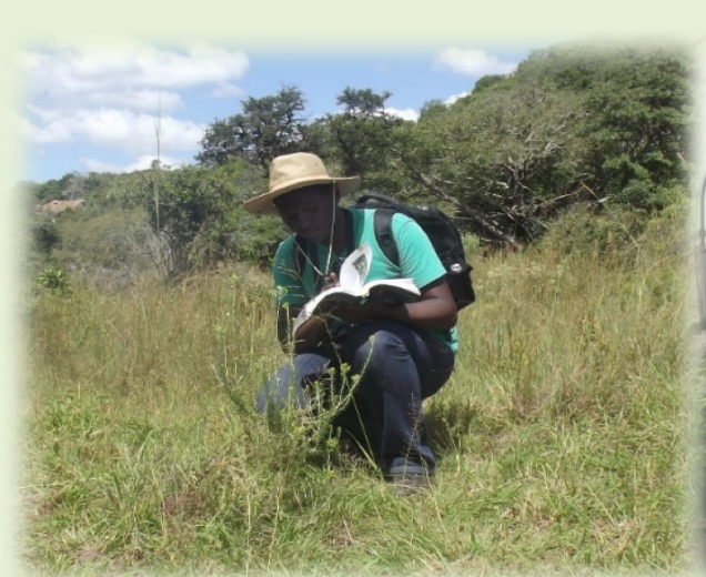
Soutpansberg mountain field collection, Limpopo