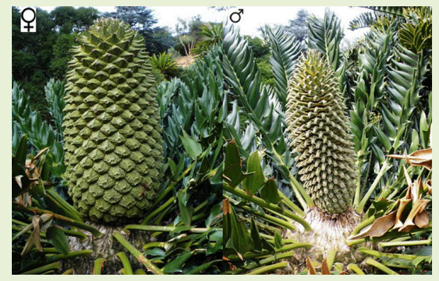
Testing lipids presence and the effect of desiccation on Cycad pollen