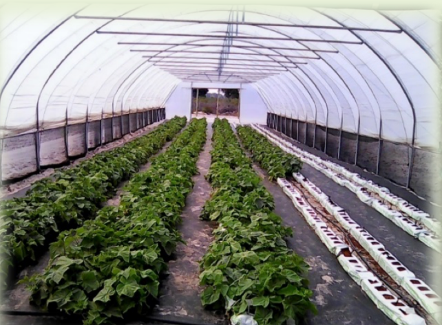
Mamre agricultural farming tunnel