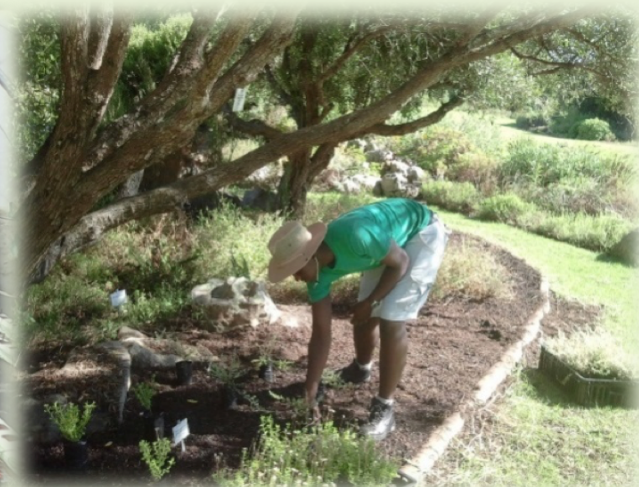
Plant placement at Kirstenbosch