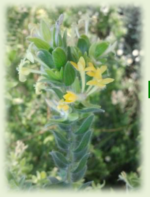
PlantZafrica published articles www.pza.sanbi.org.za