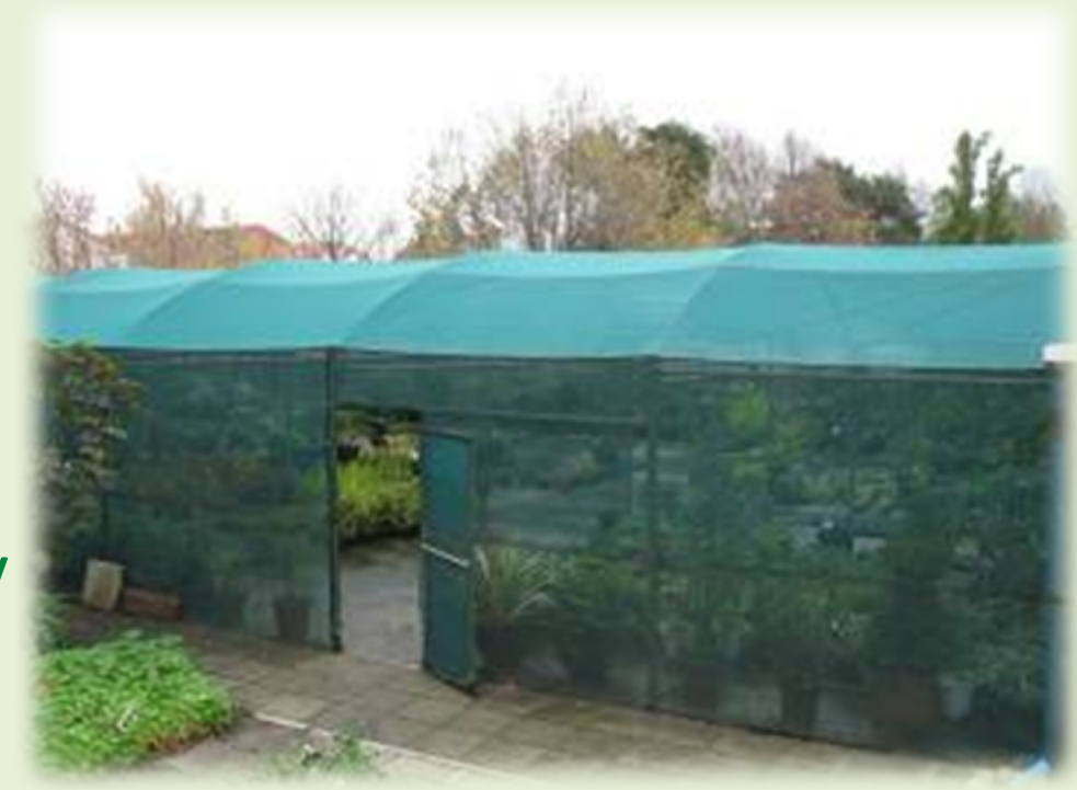
CPUT shade house