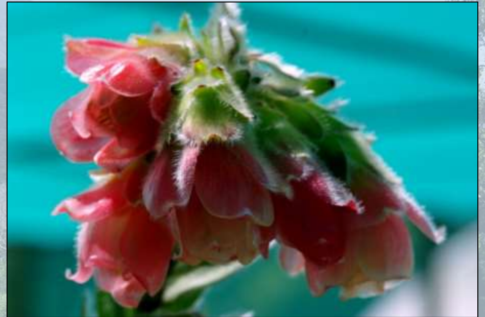
Orothamnus zeyheri "The Marsh Rose"