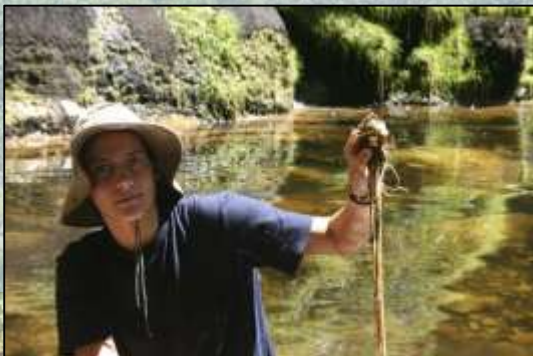
Collecting Gladiolus cardinalis bulbs. Villiersdorp 2013