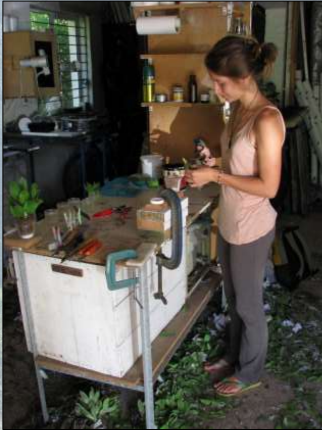
Grafting away in the workshop.