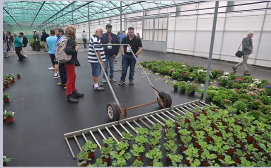
Medium fork lifters are effective and saves time (60 pots)

Light weight fork lifters for few and narrow rows of pots