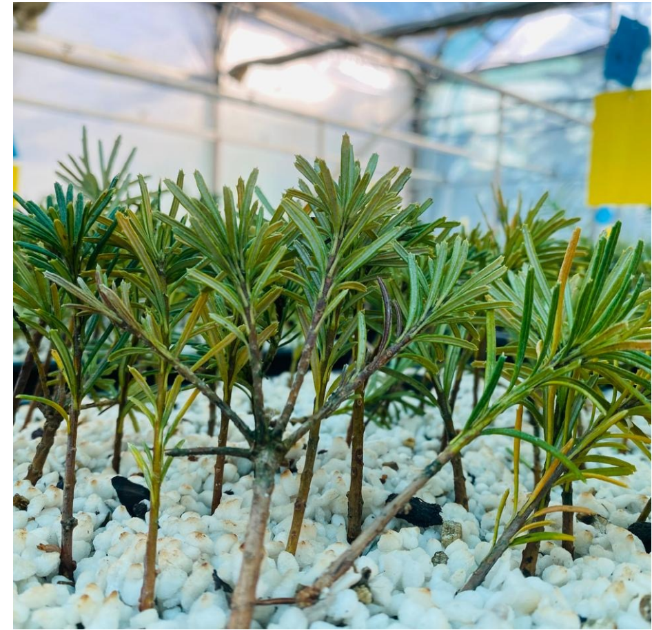
The use of Perlite as propagation medium.