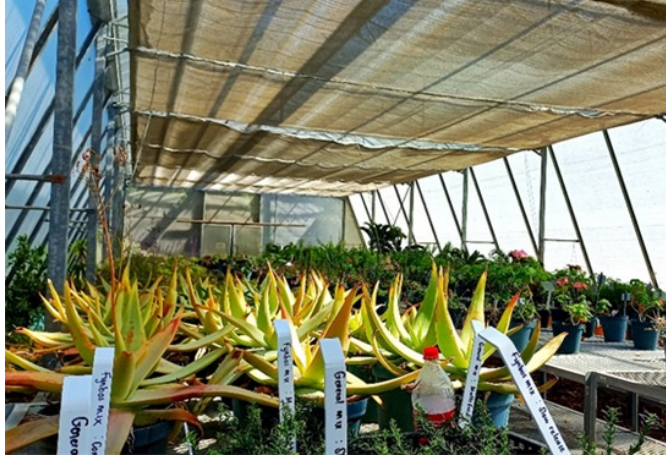
Curation of living collection