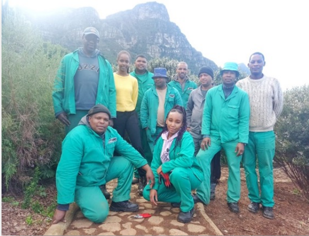
Garden planning and development