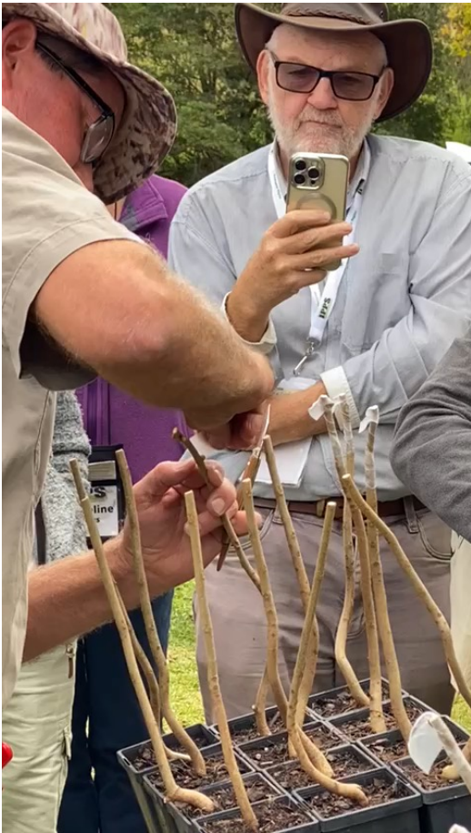
Brachycton breeding & Propagation