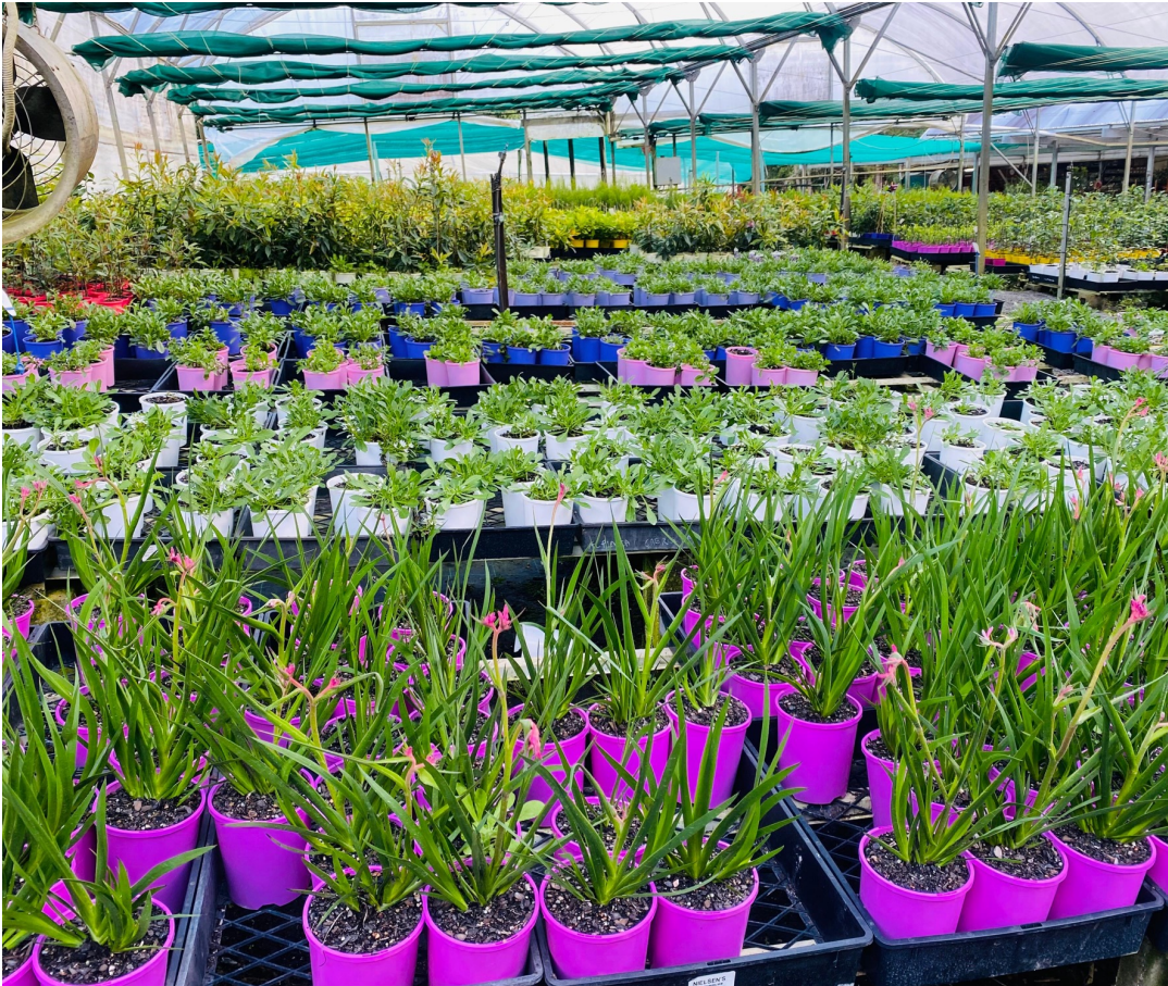
Use of different color pots for easy identification

Conference highlights: Horticultural trends and machinery