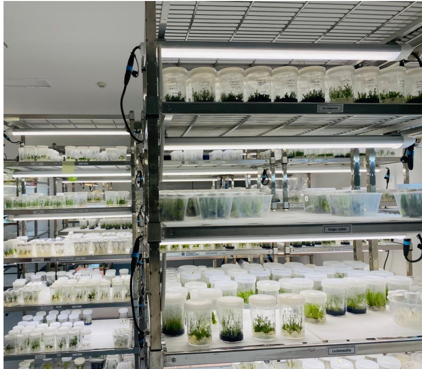
Tissue Culture Laboratory