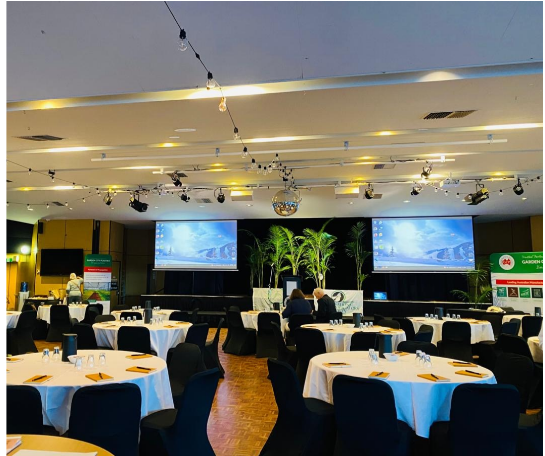
Meeting the 6Packers and setting up the venue for conference proceedings