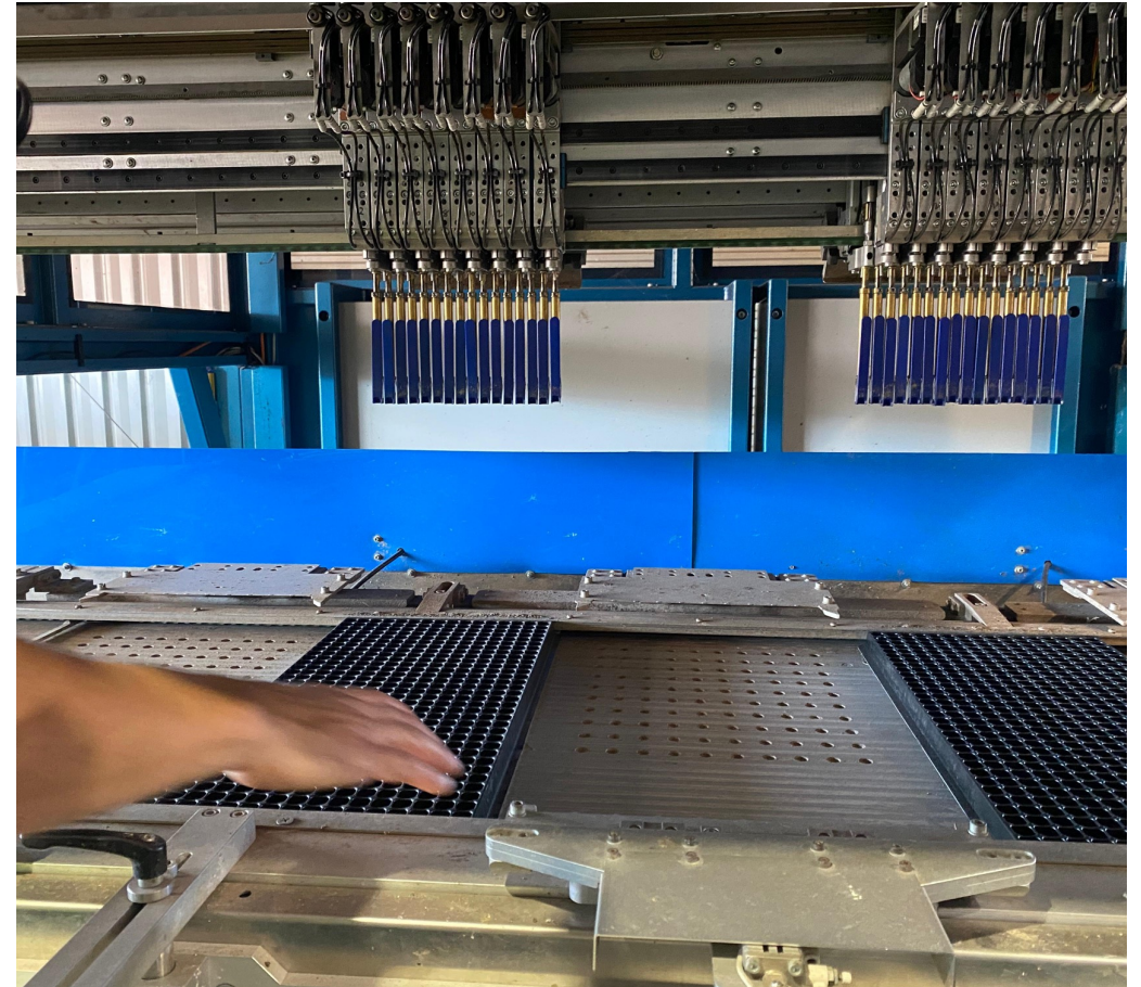
Automation in Horticulture