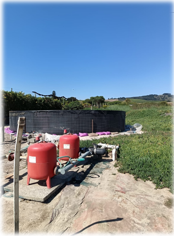
A. Reservoirs & Red Sand Filters