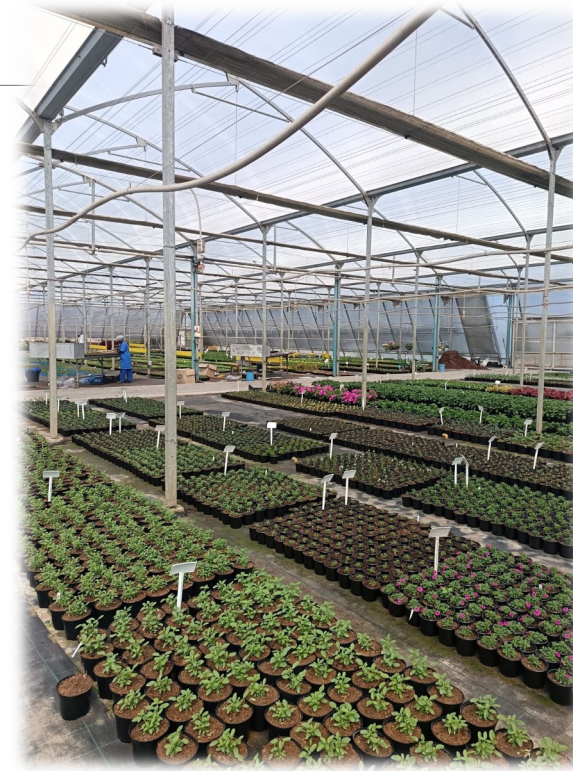
B. Inside view of Greenhouse