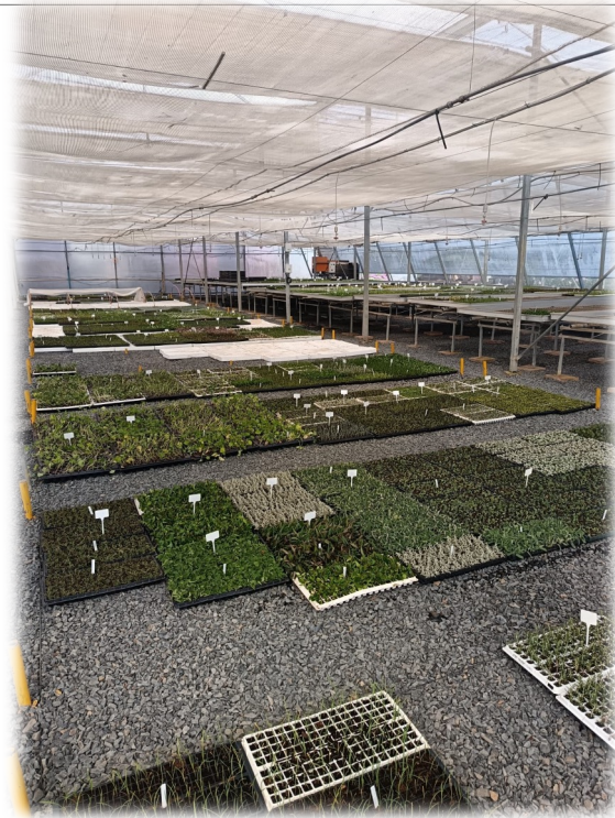
B. Inside view