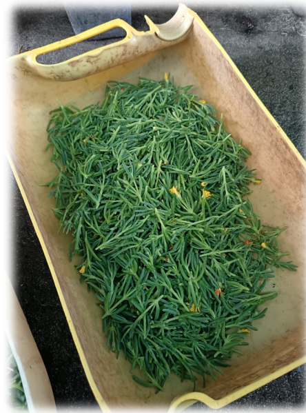
C. Lampranthus sunshine yellow