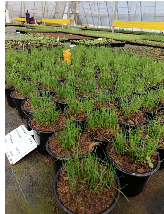
C. Chives in 12cm pots