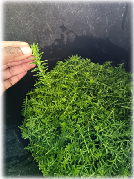
A. Felicia echinata Blue