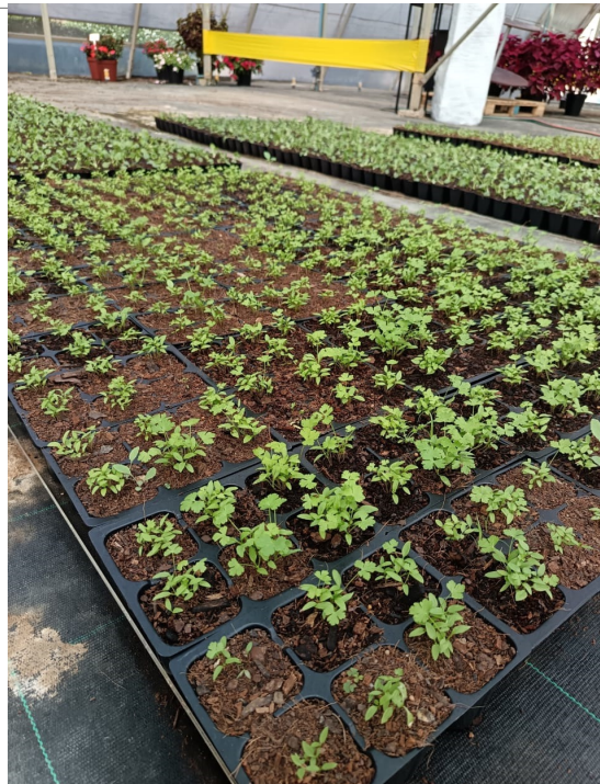
B. Parsley in 6pack trays