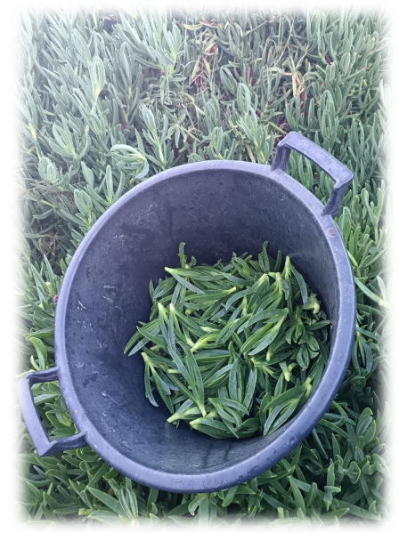
D. Carpobrotus murri