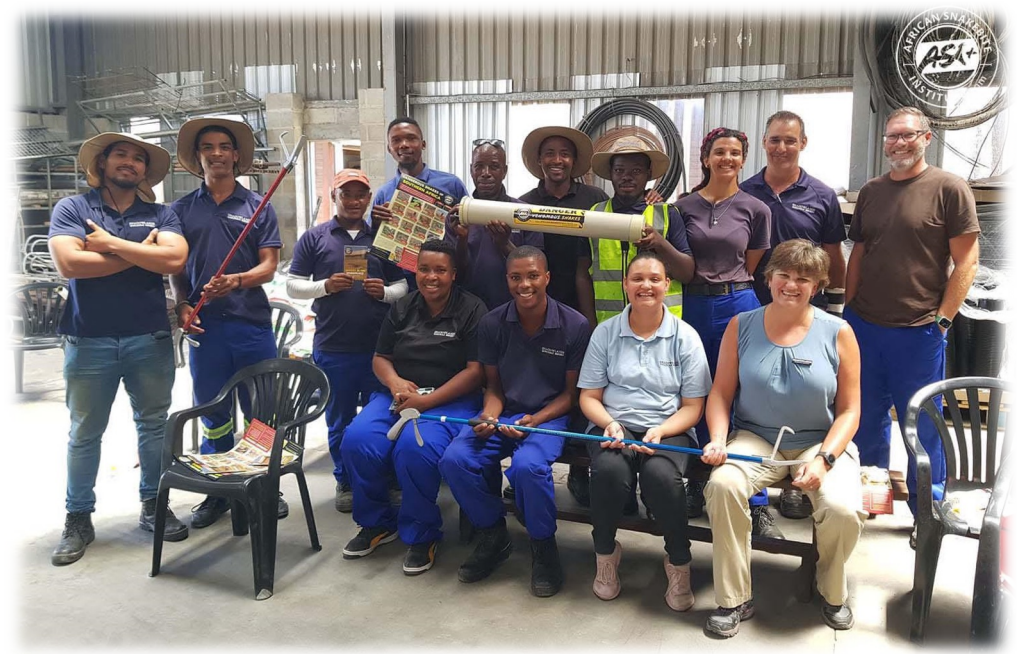
B. Snake Training