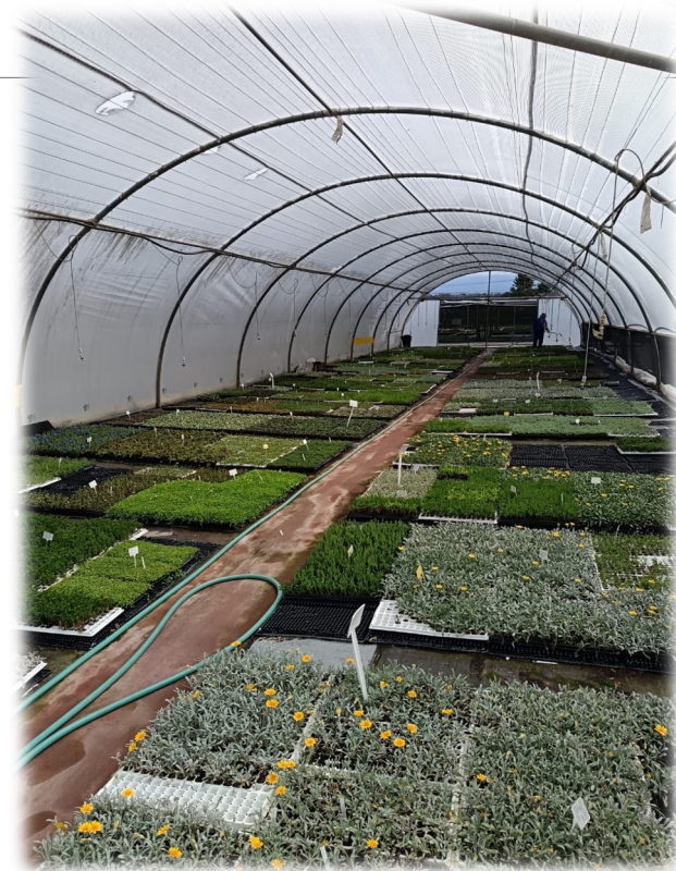
B. Inside view