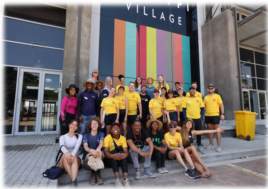
A. Greenpop organization at Philippi village