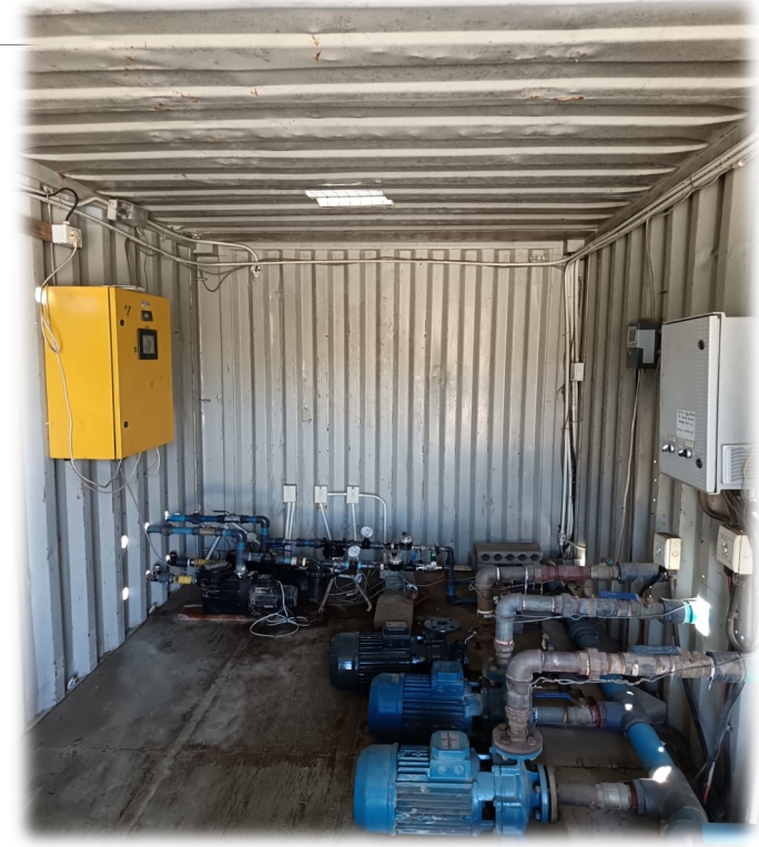
C. Pump station