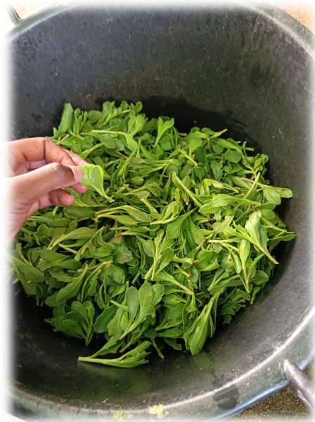
B. Osteospermum Ricky