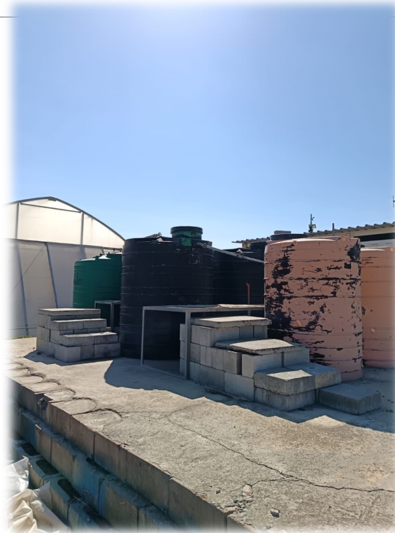
B. Fertiliser tanks A&B