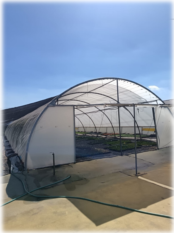
A. Hardening-off tunnel