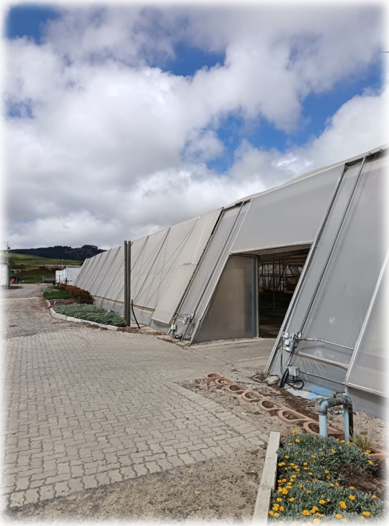
A. Propagation Greenhouse