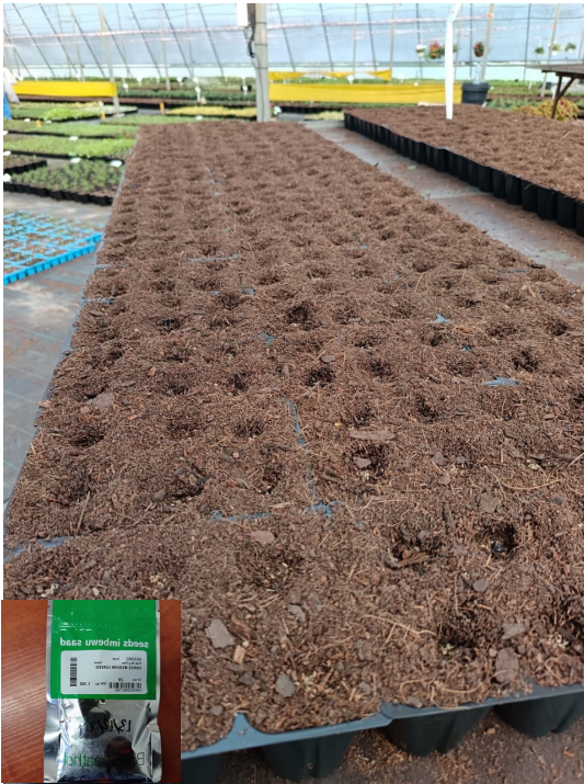
A. Seed sowing