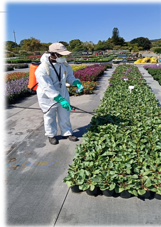
B. Pest and disease management