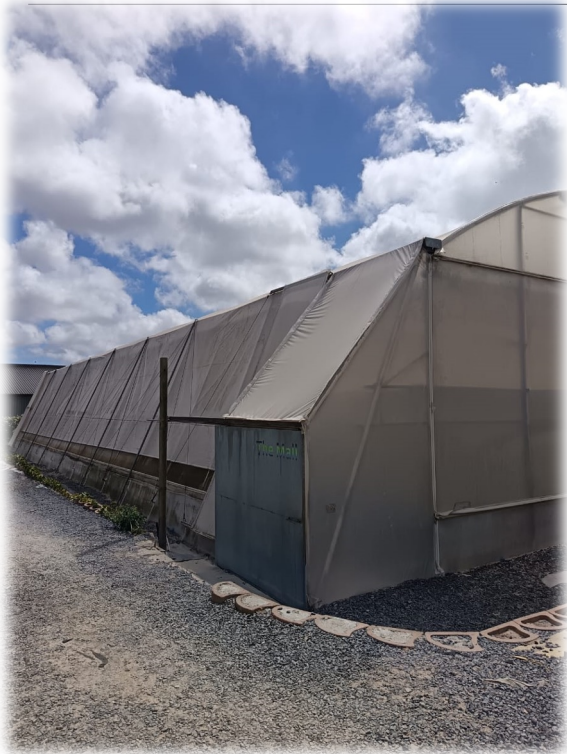
A. Propagation greenhouse (The Mall)